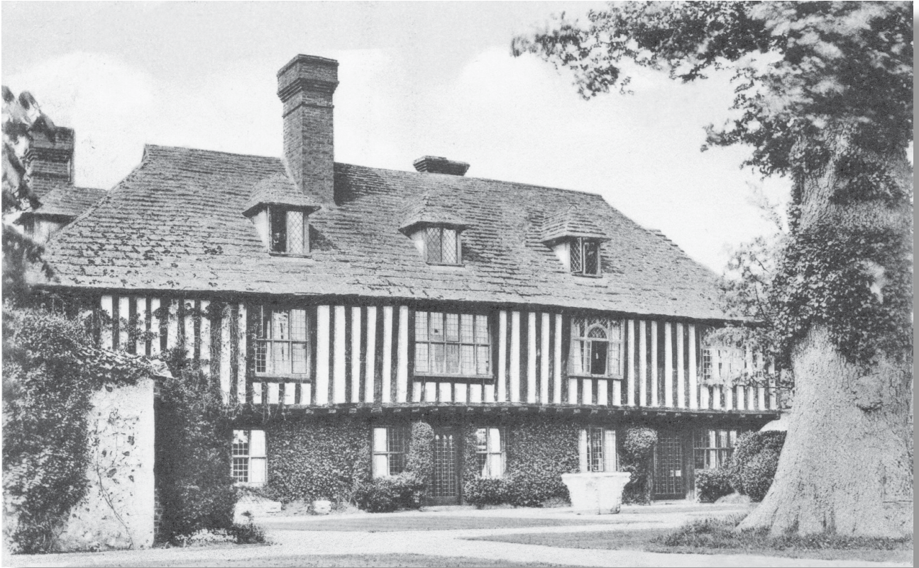
8 June 1905 (above) St Mary's, Bramber, West Sussex. A restored pilgrim Inn dating from 1470, this half-timbered house has some unique painted and decorated rooms dating from Tudor times.