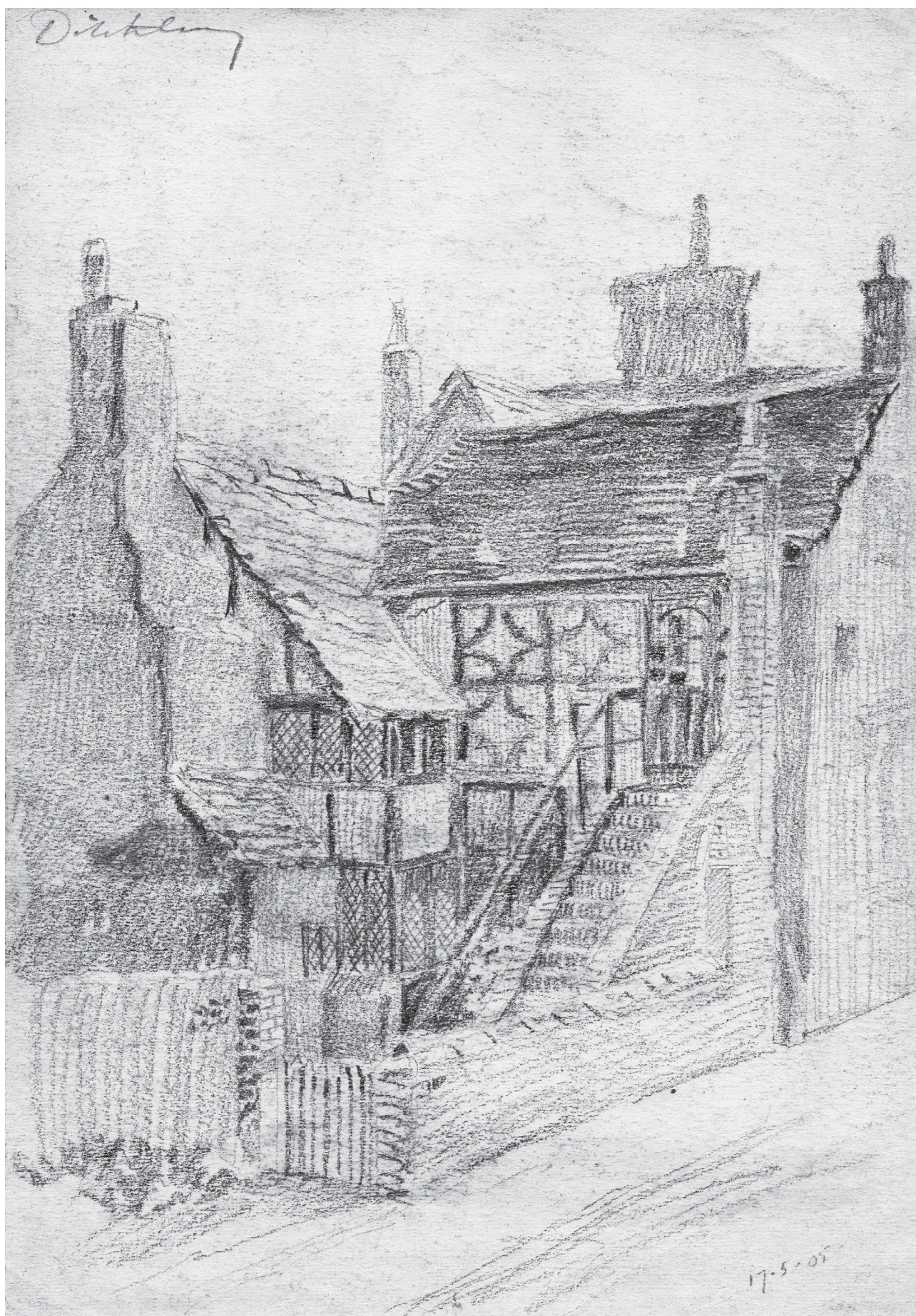
17 May 1905 (above) House with outside steps in West Street, Ditchling, East Sussex. Compare this sketch with the postcard on the opposite page.