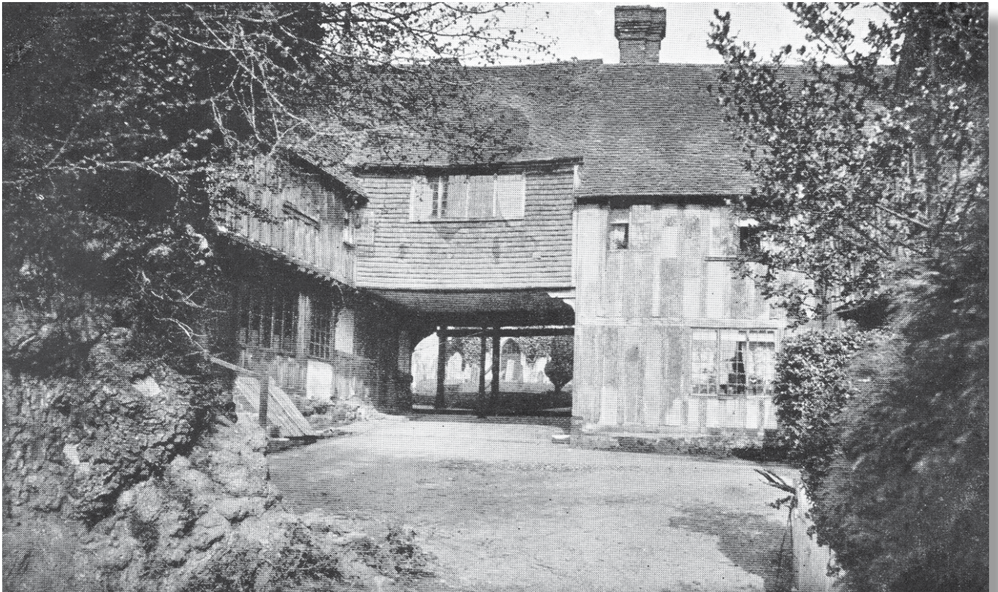
23 June 1905 (below) Leicester Square, Penshurst, Kent. The Church House is to be seen in the square on the left as you face the church. One of possibly only two still left standing in England.