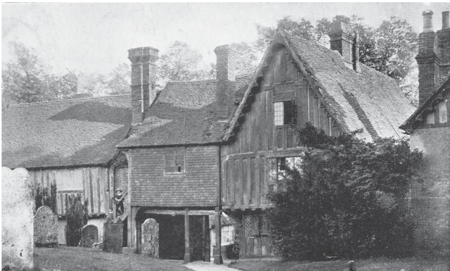
23 June 1905 (above) Lych-gate, Penshurst, Kent. The lych-gate at the entrance to the cemetery of the parish church of St John the Baptist. Leicester Square (see photo to the left), a collection of 15th and 16th century half-timbered houses, is adjacent to the church.